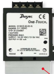
Optional NPT connection block