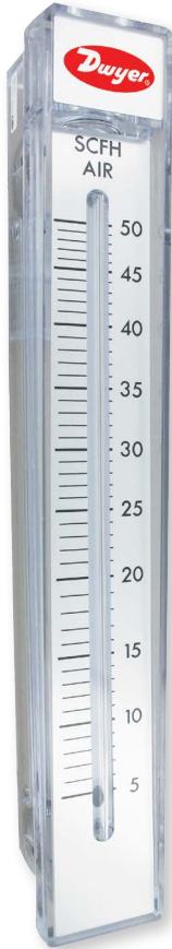
Model RMC 10" scale, 15-3/8" high