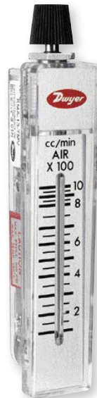
Model RMA-TMV 2" scale, 4-13/16" high