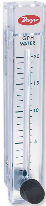
Model RMB-SSV 5" scale, 8-3/4" high